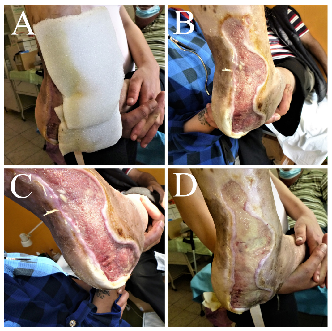
Fig. 2. The pressure sore of the lateral margin of the left sole (A). Polyurethane foam dressings were applied, leading to the formation of the granulation tissue (B,C). Because of a delay in treatment, the newly formed granulation tissue was covered with fibrin deposits (D).

Figure 2D is significant for the absorbent properties of polyurethane foam dressings. Usually, the dressings have to