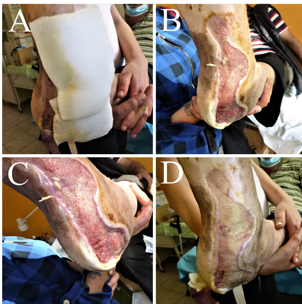
Fig. 2. The pressure sore of the lateral margin of the left sole (A). Polyurethane foam dressings were applied, leading to the formation of the granulation tissue (B,C). Because of a delay in treatment, the newly formed granulation tissue was covered with fibrin deposits (D).

Figure 2D is significant for the absorbent properties of polyurethane foam dressings. Usually, the dressings have to