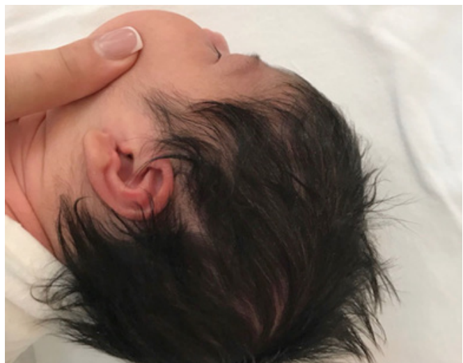
Fig. 7. New-born profile