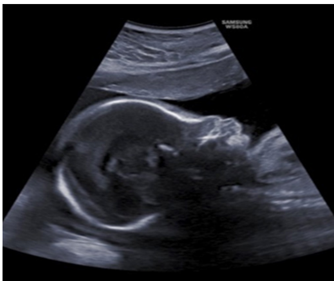
Fig. 4. 2D Binder syndrome, nasal hypoplasia, wide-angle