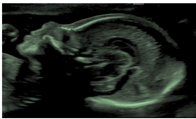
Fig. 5. Normal 2D profile (sharp angle)