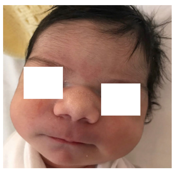
Fig. 6. New-born hypermetropia