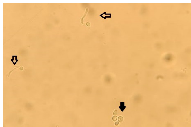
Fig. 4. Representative image showing C. albicans germ tube formation in the presence of IL-6. Outlined arrows – cells with germ tubes; full arrow - cells without germ tubes