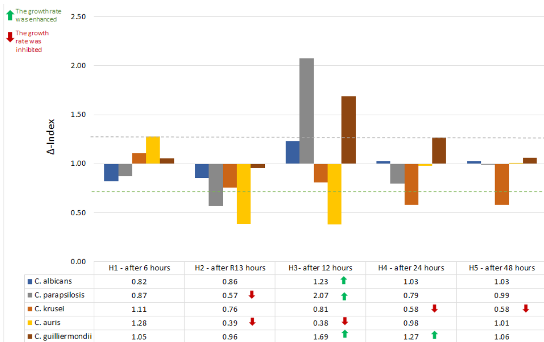
Fig. 1. The influence of IL-6 on the growth rate of five Candida spp.