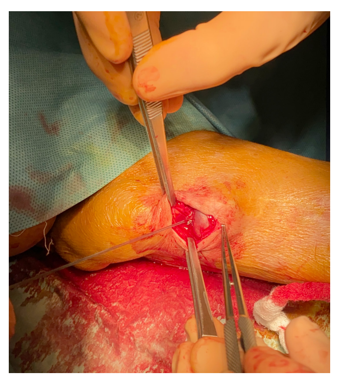
Fig. 2. Intraoperative photo: ligature of ulnar-basilic AVF, right after the anastomosis between the ulnar artery and the basilic vein.

On the 2nd day post-intervention, the patient underwent a hemodialysis session through the temporary venous catheter and was discharged in good general condition, with the characteristic thrill absent at the level of ulnar-basilic AVF and the arteriovenous communication thrill present at the level of the right radio-cephalic AVF. The patient underwent hemodialysis sessions 3 times a week, for 6 weeks, until the new AVF matured. Subsequently, dialysis will be performed using the right radiocephalic AVF.